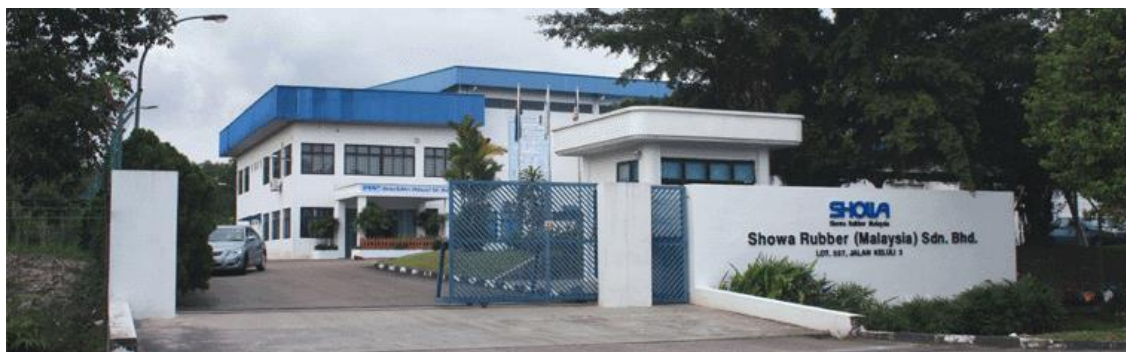
SRM Head Office and Factory located in Pasir Gudang, Johor, Malaysia