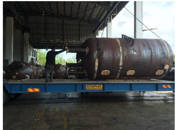
Strong Performance during 1 st Quarter of 2014(Jan- Mar)

We did not achieve all of these requirements overnight, but very painfully. Therefore, we are here to stay as long as such services are required by the world.